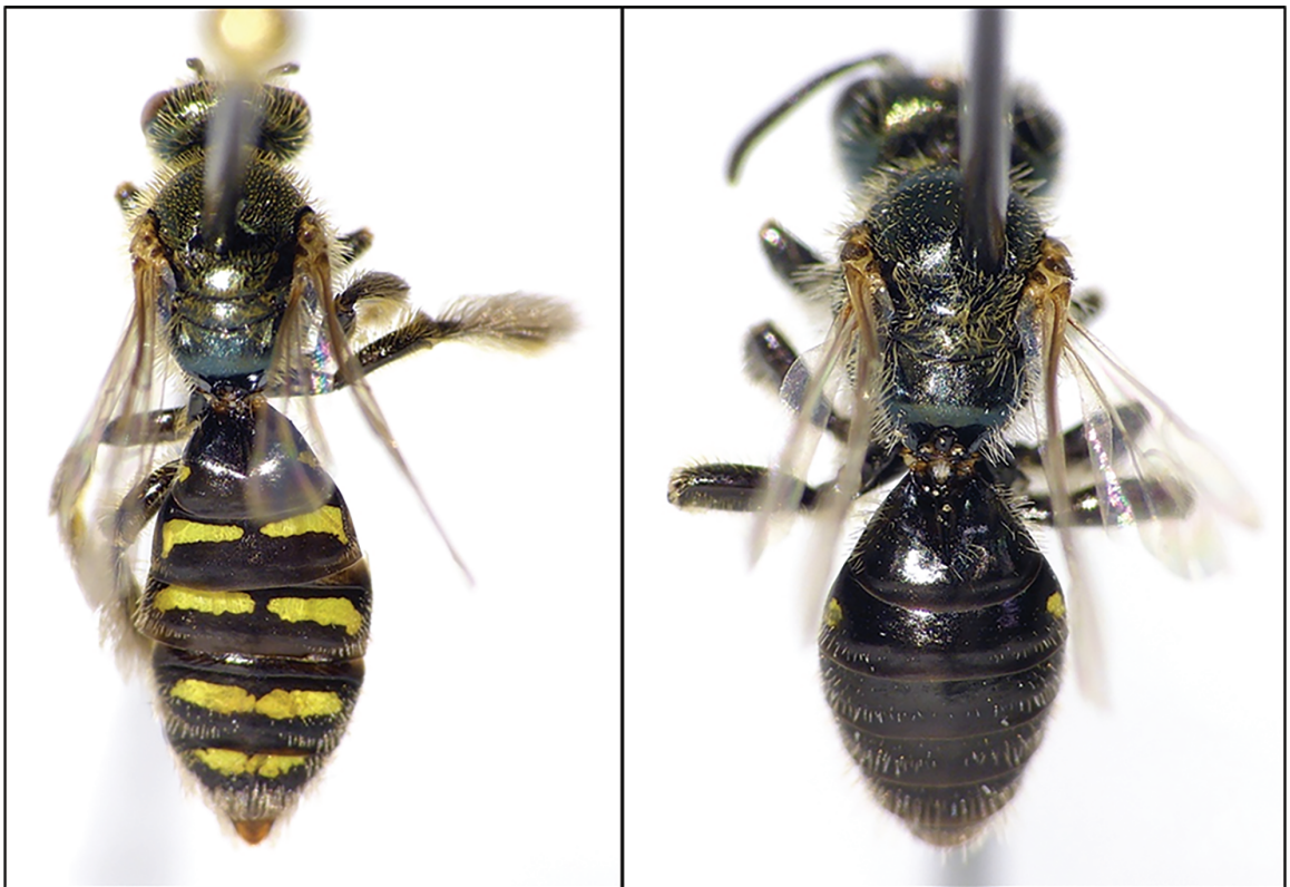
Figure 1. Female (left) and male (right) P. bequaerti from Hadley, MA.

During late July through September, 2019, we conducted a survey of bees on Helianthus at 14 farms in the Connecticut River Valley of western Massachusetts. Out of more than 1100 bees sampled during this project, we collected five specimens of P. bequaerti (Fig. 1) from two farms. On 14