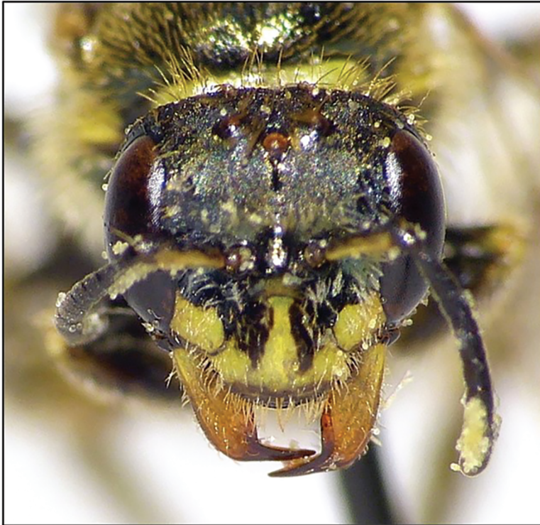
Figure 2. Face of female P. bequaerti from Hatfield, MA, showing the strongly recurved mandibles.

August 2019, we collected a single female P. bequaerti on Helianthus annuus L. at Golonka Farm in Hatfield, Massachusetts (42.4147°N -72.6134°W). Roughly two weeks later, on 29 August 2019, we collected four more individuals of P. bequaerti (one female and three males) at Astarte Farm in Hadley, Massachusetts (42.3380°N -72.5994°W). Two males were collected from Helianthus annuus , while the female and a third male were collected from Helianthus maximiliani Shrad. Both females clearly exhibited the highly reflexed mandibles characteristic of the subgenus Cockerellia (Fig. 2). These five specimens represent the first records of P. bequaerti from New England, with